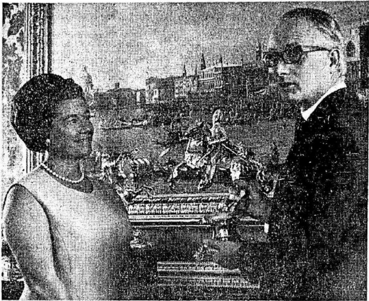
The Duke and Duchess of Bedford in their private dining room at Woburn Abbey. The painting, one of 21 Canalettos in the room, is of the Bucintoro, the state-boat of the Doge of Venice.